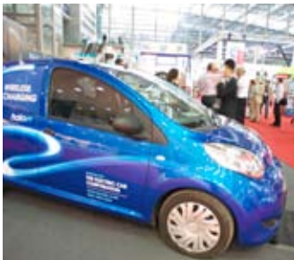
The Shenzhen EV Parade promoted new energy vehicles to the public.