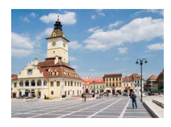
For more details, and for information on submitting abstracts, please visit http://conat.unitbv.ro