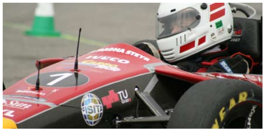
The 2008 competition will also see a record number of teams taking part, with 110 entries from 90 universities in 22 different countries.