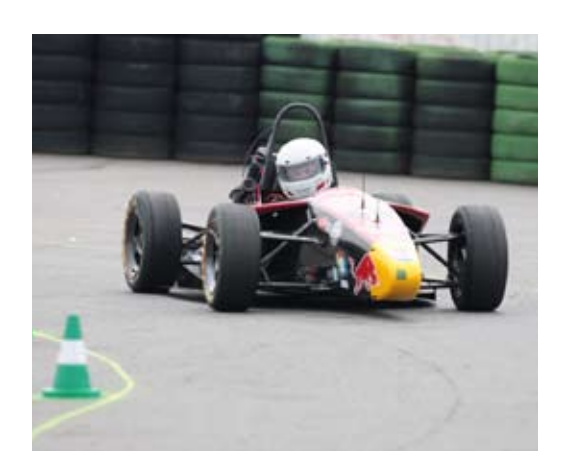
Demand has outstripped supply at this year's UK Formula Student event, with places 'sold out' in under 48 hours, a first for the competition run by IMechE at the famous Silverstone racing circuit (10–13 July 2008).