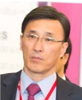
Top Hyundai's booth at the SAE 2013 World Congress.